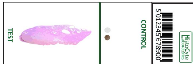
Figure 2. ALK-Lymphoma Analyte Control appropriately placed on a slide.